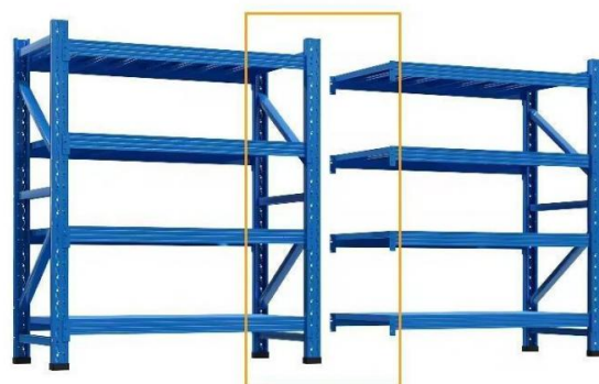
Main frame and sub frame share one column

The main frame has two columns frames, which can be used independently, Add on rack cannot be used alone, which must be used with the main rack.