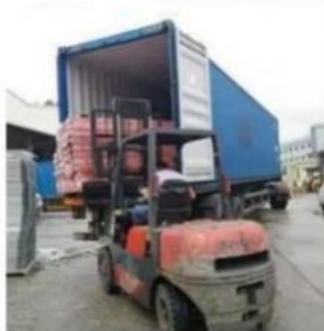
Loading for Beam