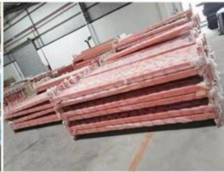
Package for Beam