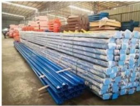
Package for Upright Frame