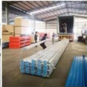
Loading for Upright Frame