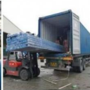
Loading for Wire Mesh Cage