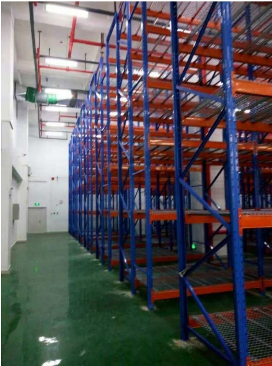
Packaging & Shipping